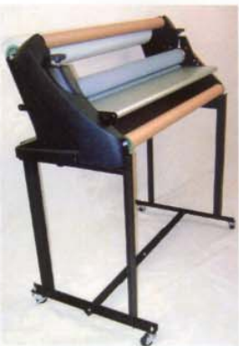
Optional stand makes your Quikmount 4 mobile and saves table space