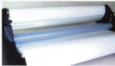
Thread the laminate between the two rollers