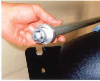
Simply lift shaft out of the U channel to change roll