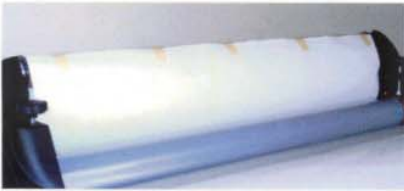
Automatic take up reel winds up release paper