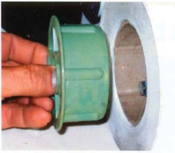
Insert hubs into laminate core