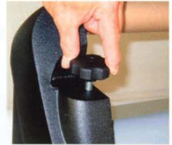
Two knobs adjust height and pressure of top roller