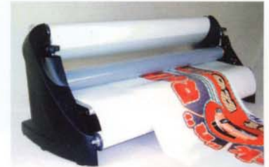
Insert the print, turn on the motor and get a smooth, bubble free finish